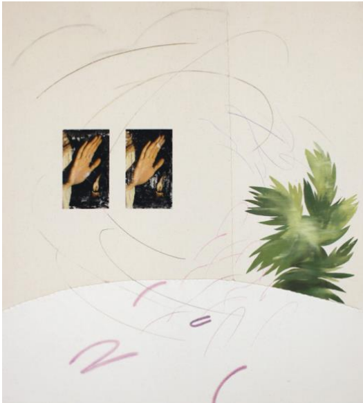
Jacopo Dal Bello, Mirrored Mirror, mixed media on canvas, 90 x 80 cm