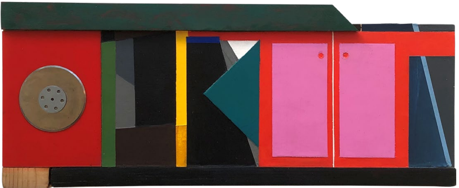
Deep Turquoise Filtered Pink 2019 Acrylic, Wood, Collage 42 x 17cm

Aleph Contemporary www.alephcontemporary.com