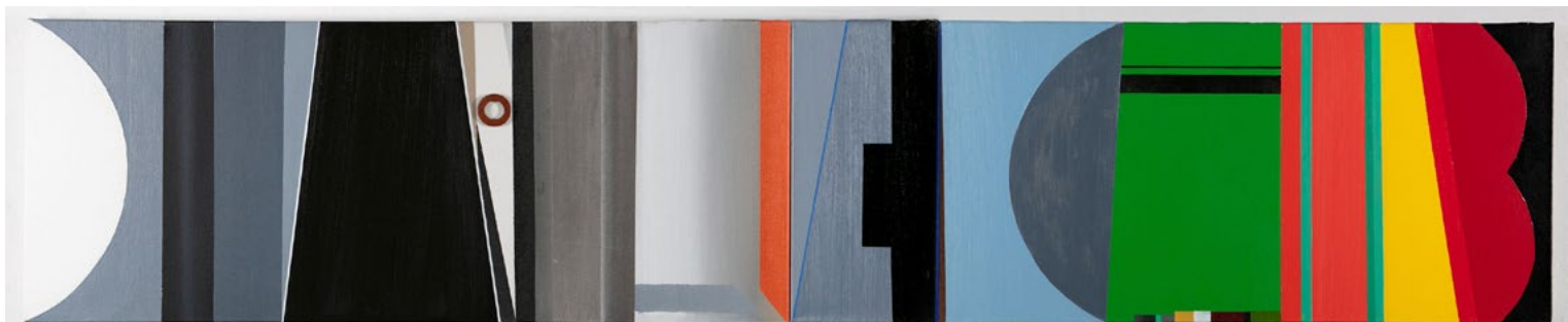
Soft Red Filtered Grey 2017 40 x 200cm Acrylic and Collage on Canvas