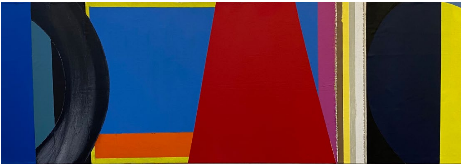
Soft Red Filtered Lemon 2020 60 x 182 cm Acrylic and Canvas on Canvas

Noga's work is a unique combination of geometric painting and systematic assemblage. He intuitively selects and arranges strips of paint and found material into a panoramic format that combines personal visual references with a strong geometric sensibility. The ten multi-layered works in the exhibition immerse the viewer in a universe that the artist describes as "imperfect geometry." He uses a variety of materials, including acrylic, oil, collage, powdered pigment, steel,